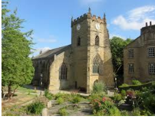
St Thomas the Martyr Church Church Street, Up Holland, Skelmersdale, Lancashire WN8 0ND