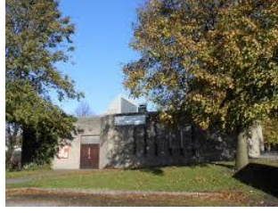
Christ The Servant Church Birkrig, Skelmersdale Lancashire WN8 9HW